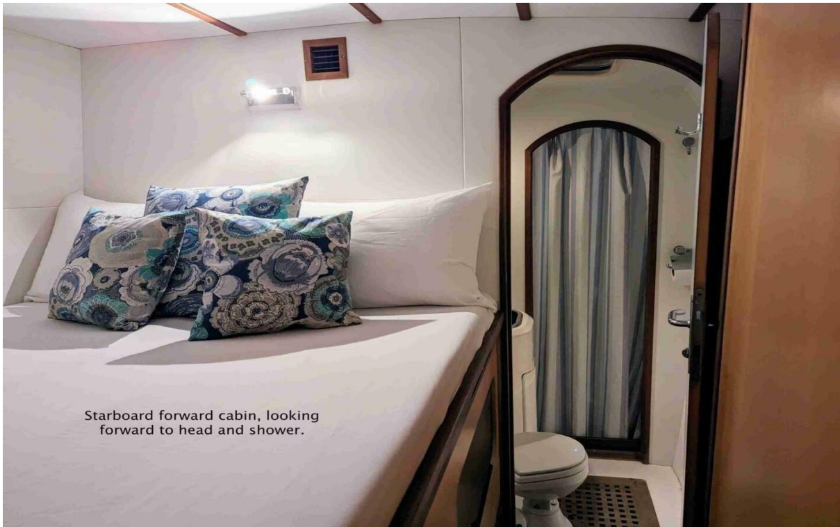
Starboard forward cabin, looking forward to head and shower.