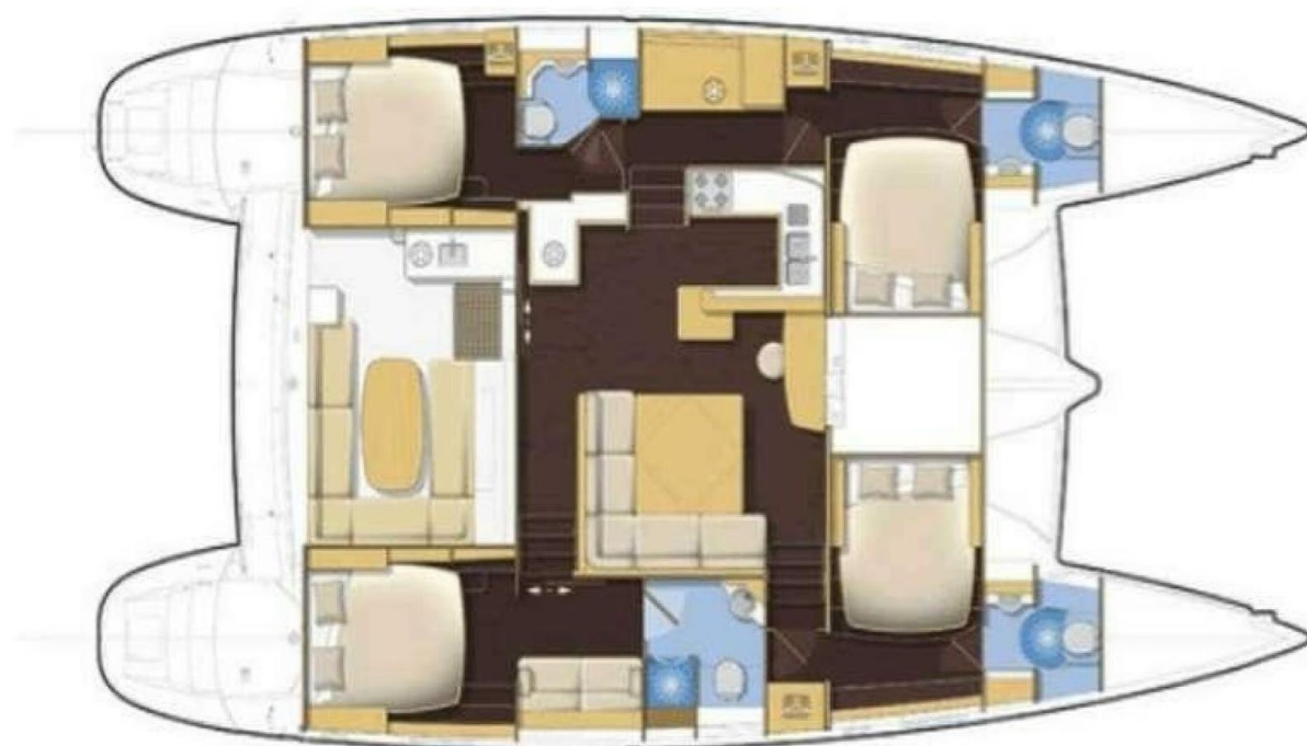
Version propriétaire 4 cabines / Owner's version 4 cabins